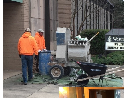
Mortar being made

This is a good place to stop in the Lift Project saga. Join us in the next edition of the Window to see how the Lift Project progresses. ☸