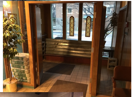
Parish House becomes a make-shift warehouse for I-beams, cement blocks, and mortar.