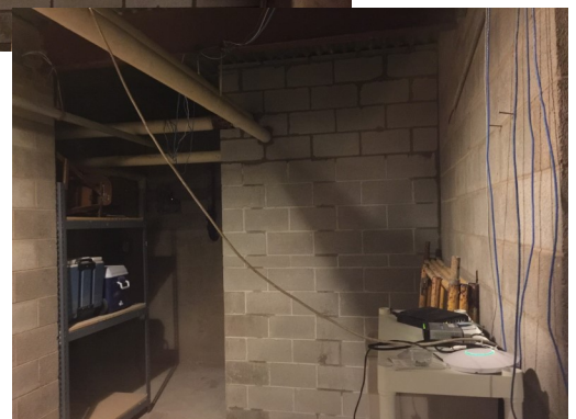
Electrical wiring rerouted around the block walls.