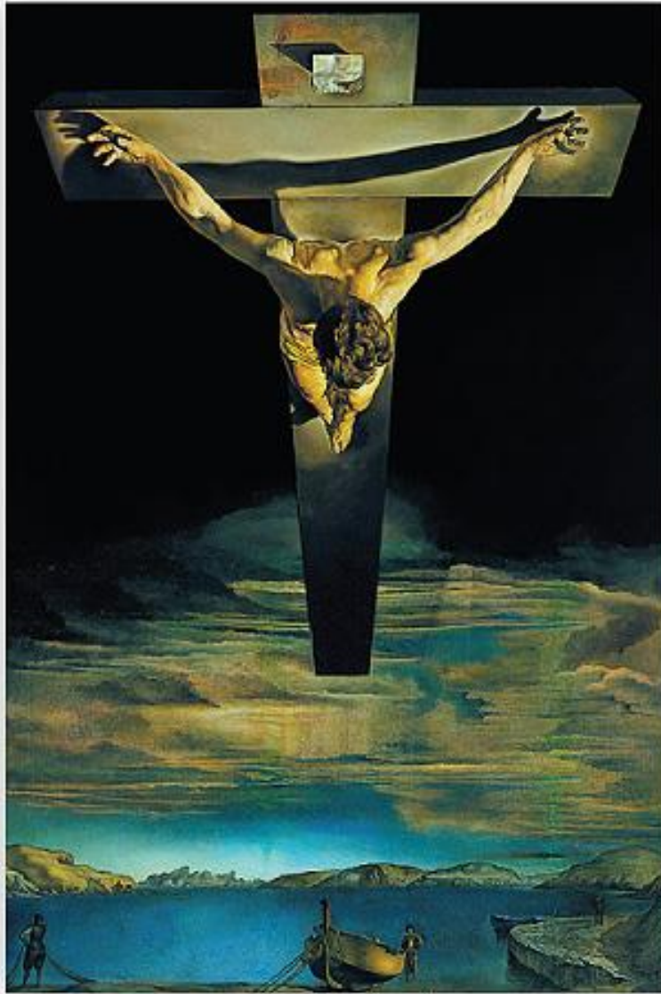
Christ of St. John of the Cross (1951) Salvador Dali (1904 - 1989)

This monumental painting of the Surrealist, Salvador Dali stands more than eight feet tall by four feet wide. From the Cross, Jesus looks down on the world he came to save. It is a great statement of faith from a great artist. Note, there are no nails and no blood on the corpus. The Savior looks down on the sea and the fishermen he knew in love. (Original painting is at the Kelvingrove Museum, Glasgow, Scotland)