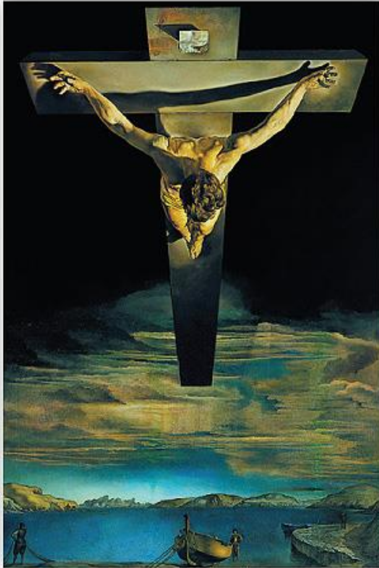
Christ of St. John of the Cross (1951) Salvador Dali (1904 - 1989)

This monumental painting of the Surrealist, Salvador Dali stands more than eight feet tall by four feet wide. From the Cross, Jesus looks down on the world he came to save. It is a great statement of faith from a great artist. Note, there are no nails and no blood on the corpus. The Savior looks down on the sea and the fishermen he knew, in love. (Original painting is at the Kelvingrove Museum, Glasgow, Scotland)