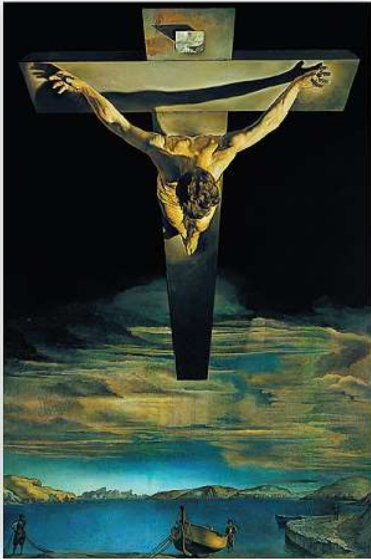
Christ of St. John of the Cross (1951) Salvador Dali (1904 - 1989)

This monumental painting of the Surrealist, Salvador Dali stands more than eight feet tall by four feet wide.